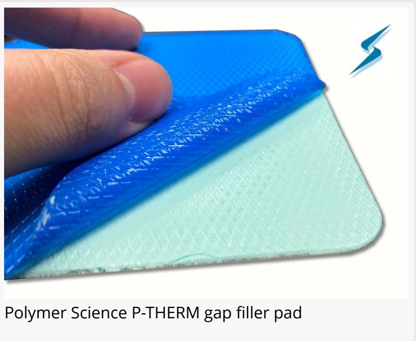
Polymer Science P-THERM gap filler pad

PA-2505 Gap Filler has Hardness: 54 Shore 00, Thermal Conductivity: 5 W/m K, and Dielectric Breakdown Strength: 18.00 kV/mm.