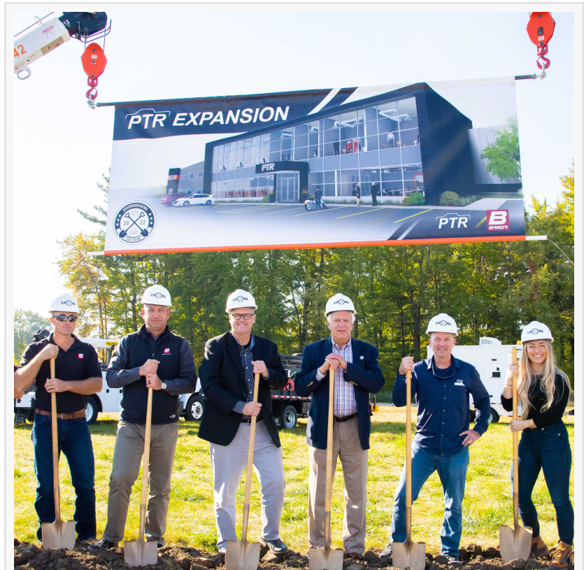
Premier Truck Rental hosts groundbreaking ceremony.