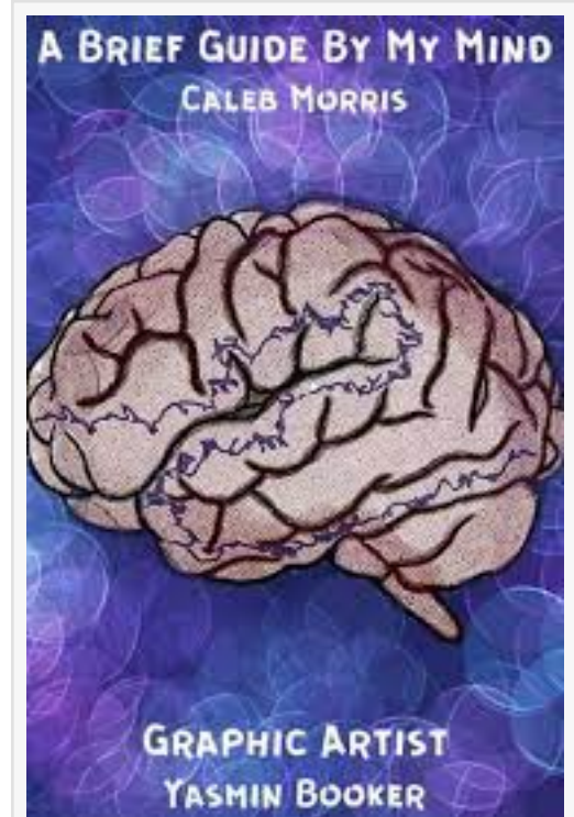
Caleb Cmo Morris

For the moment the Book is not up for release, but it is available for Pre-Order on all digital bookstores. The expected release date is January 1st 2023. C-Mo plans' is building community, taking steps towards building up others', whether that be physically, mentally, or emotionally. This is more than creativity; it is renowned work published by Caleb 'C-Mo' Morris who takes gratification in every endeavor he ventures into.