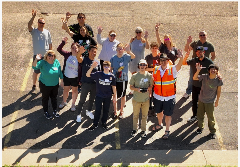
Drone Image of Neurodiversity Works Students