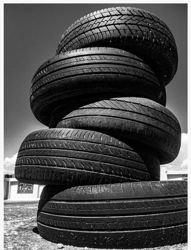
Tires need more maintenance than people realize to last as long as they do.