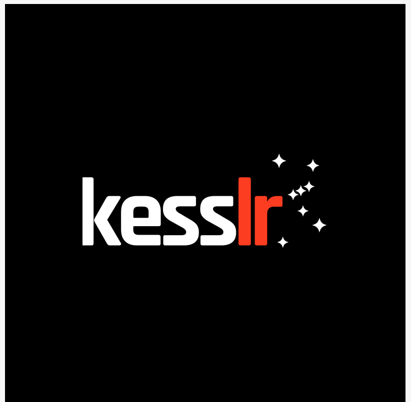
Kesslr Logo

Cosmic retailer, Kesslr, is on a mission to provide 10,000 families across the world with Fine Cosmic Decor™. Kesslr's all-aluminum line of space-related wall art is made with ultra-durable, 3mm thick di-bond aluminum. This unique material offers rich, deep colors and is complemented with a satin finish. Metal prints offer higher durability and are more resistant to unwanted dents compared to traditional canvas stretched furnishings. Apropos, considering US Census data revealed the average migration expectancy to be over 9.1 relocations.