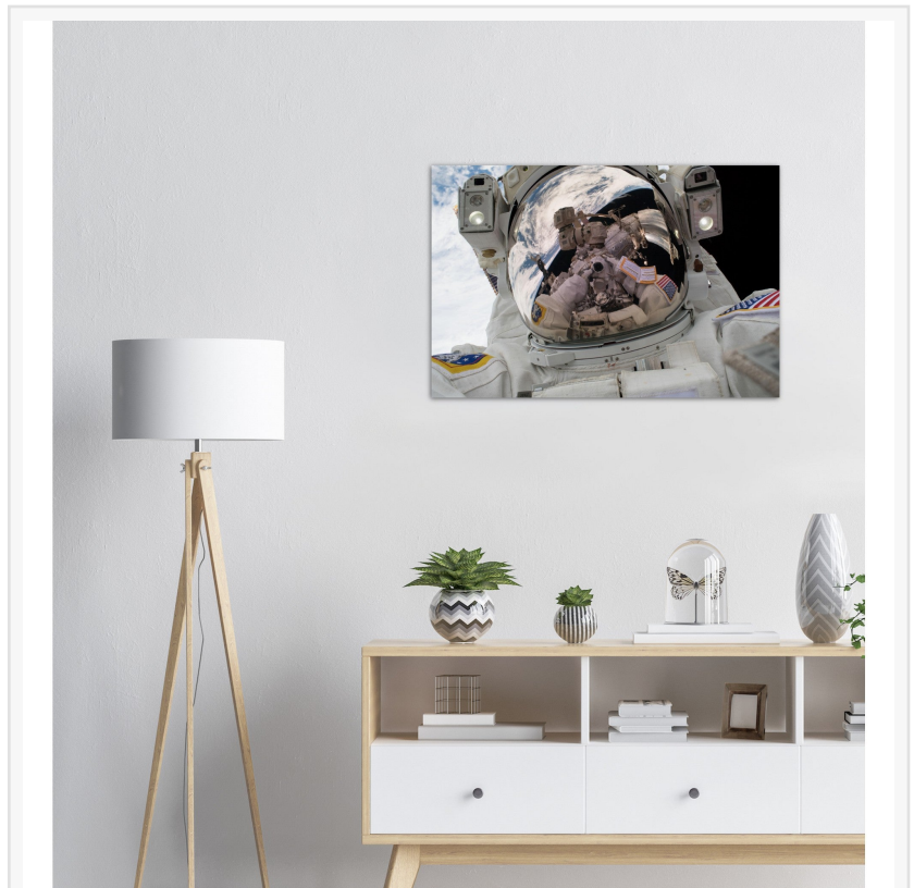
Astronaut Selfie