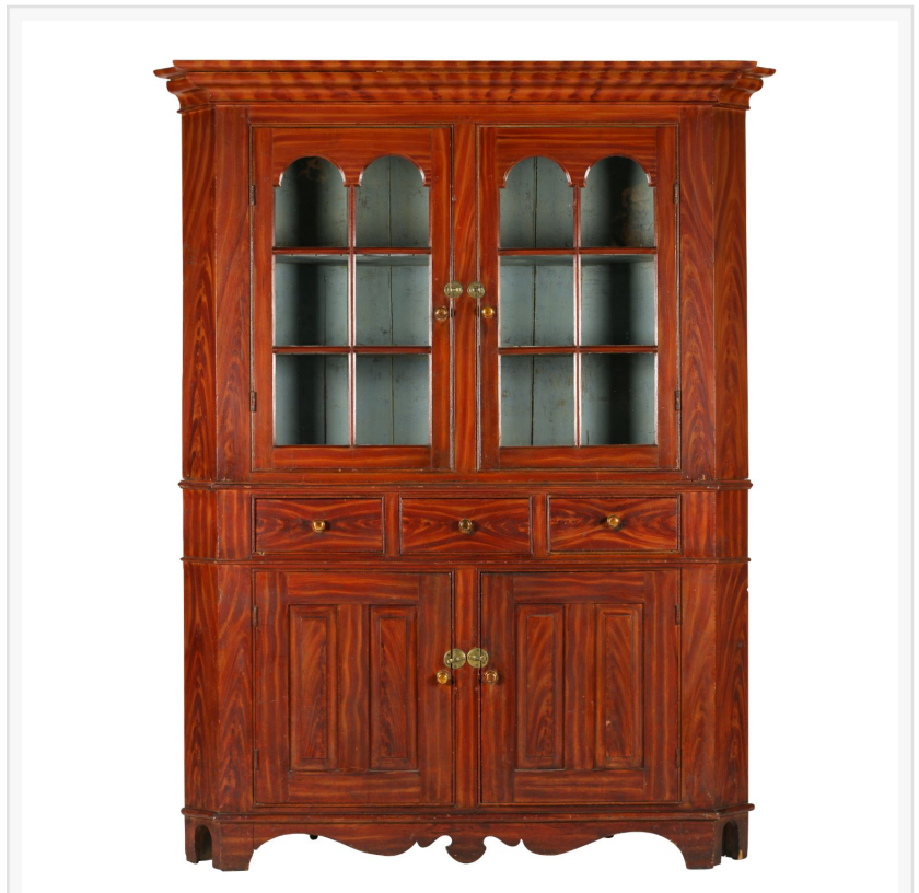
Exceptional Waterloo County (Ontario) two-piece corner cupboard with original muted red and amber paint, 84 ½ inches tall by 65 ¾ inches wide (est. CA$6,000-$9,000).

Two intriguing and attractive lots have identical estimates of $3,000-$5,000. One is a circa 1970 softwood birdhouse collage by Edmond Chatigny, consisting of a double-ended birdhouse with gable roof, displaying the flag of Italy, 35 inches by 29 inches. Small birds are on each side of the roof and the platform is covered with stylized plants and flowers. The other is a nicely embossed clear Beehive pint jar with an aqua lid, Canadian, clean, just shy of six inches tall.