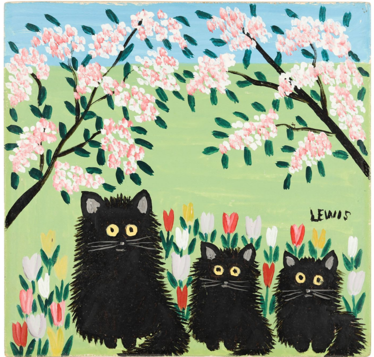
Oil on board painting by Maud Lewis (Canadian, 1903-1970) titled The Three Black Cats, a serial image only found in the mid-to-late 1960s, artist signed (est. CA$25,000-$30,000).

The second, lot 264, is another serial image, titled Horse Pulling Logs, artist signed and large at