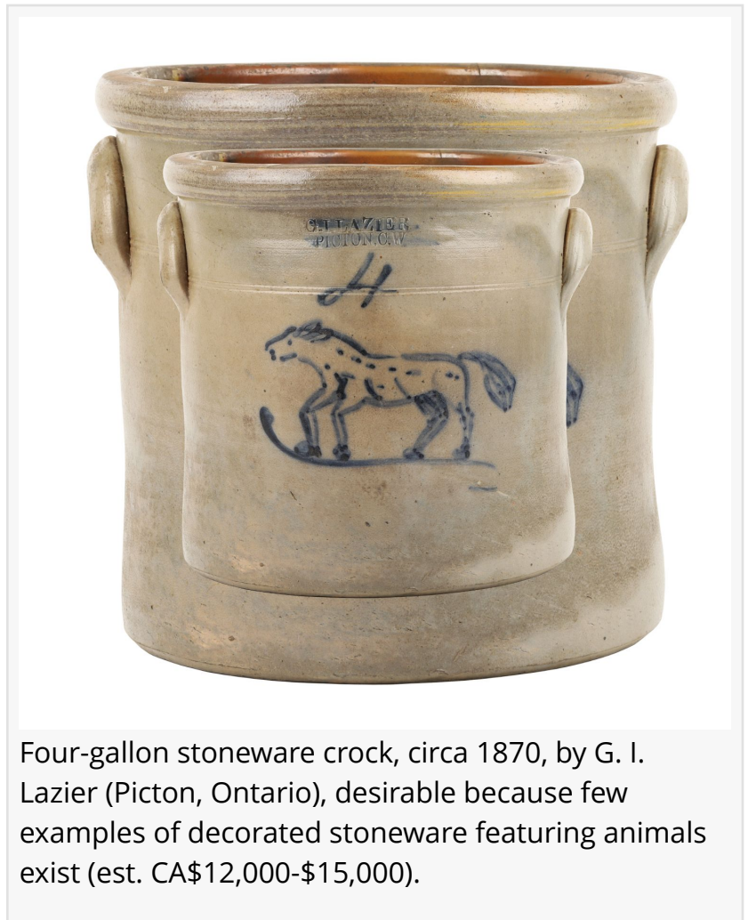
Four-gallon stoneware crock, circa 1870, by G. I. Lazier (Picton, Ontario), desirable because few examples of decorated stoneware featuring animals exist (est. CA$12,000-$15,000).

The rest of the auction is loaded with scarce items that include advertising signs, art, art pottery, Canadiana, clocks, decoys, folk art, lamps and lighting, pottery and stoneware, rugs and more. Internet bidding will be thru the Miller & Miller website ( www.MillerandMillerAuctions.com ), plus the very popular LiveAuctioneers.com. Telephone and absentee bids will also be accepted.