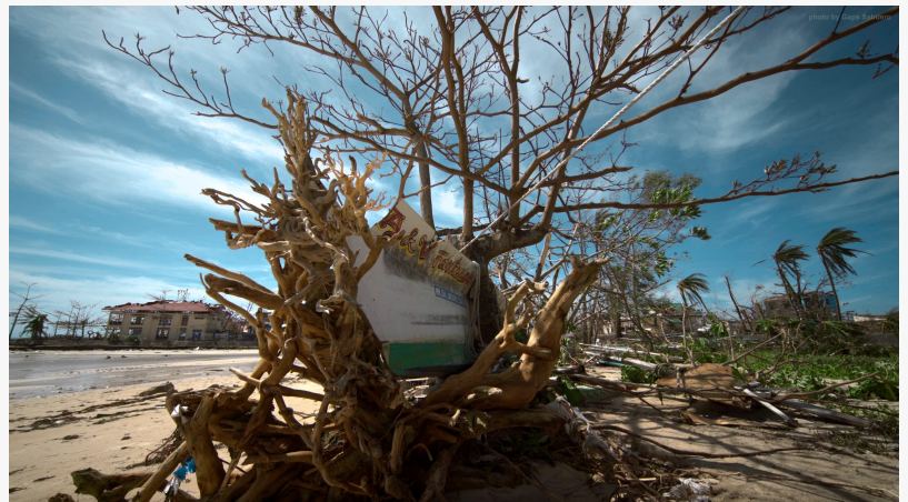
Livelihood boats used by locals for tourism and fishing were destroyed and beached in Siargao's coastlines from super typhoon Rai