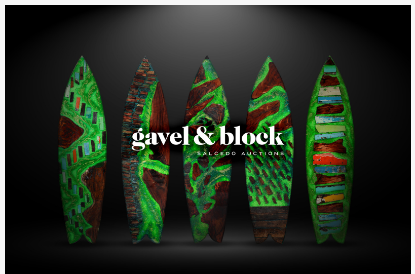
Five Scrapboards under Project Re-Dew will be up for auction under 'art+design' by Gavel&Block.

To aid Siargao in its recovery, 'art+design' by Gavel&Block, a subsidiary of Salcedo Auctions will be holding an auction that features five “Scrapboards” from Rise Siargao – an NGO that helps