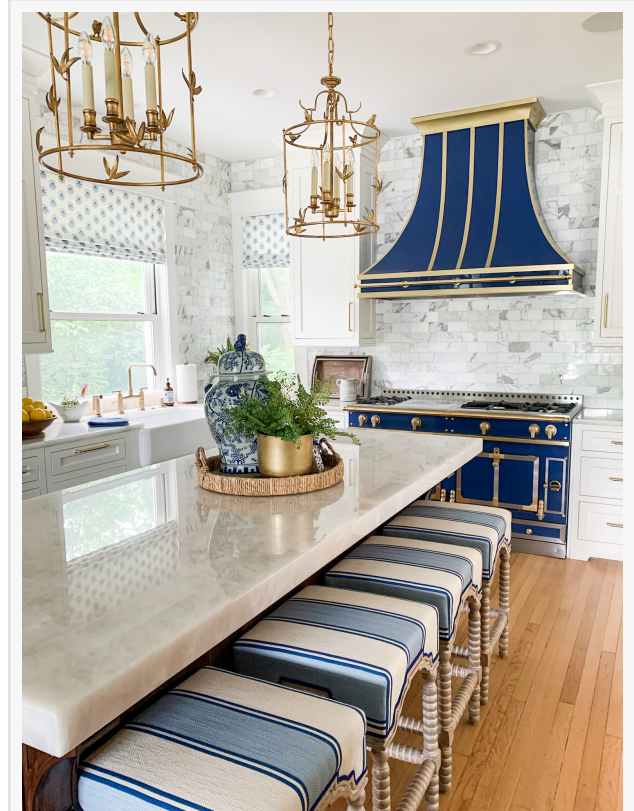
Kitchen designed for living & dining.

Handmade products, such as artisan tiles are adding flair and texture. For example, for those looking for a special