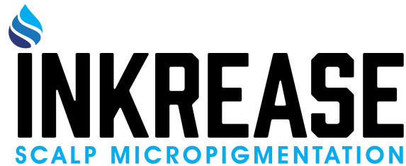
INKcrease Scalp Micropigmentation Logo

After training, graduates can participate in continuing education and support groups. "We have private online support forums and groups as well as the option to subscribe to additional support sessions with the trainers," reads the company website.