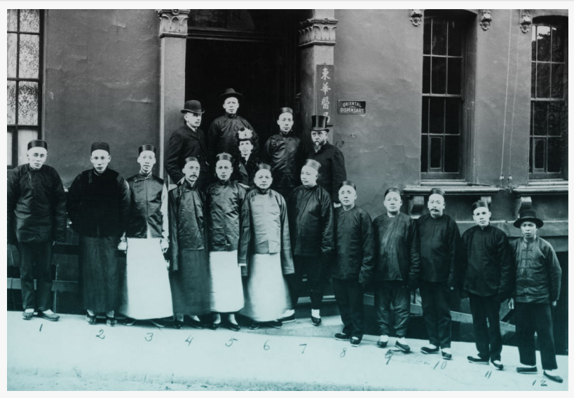
Tung Wah Dispensary opened in 1900 by the Chinese Six Companies at 828 Sacramento Street in San Francisco.

This press release can be viewed online at: https://www.einpresswire.com/article/613446925