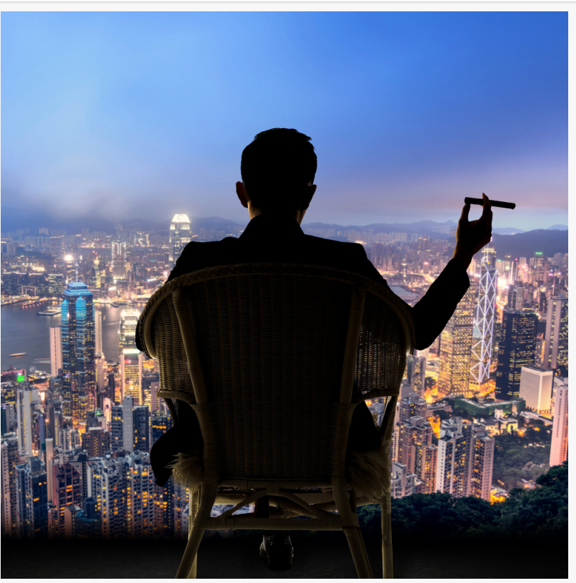
A man of power gazes over Hong Kong, an international economic powerhouse.

Due out in March, a pre-publication discount is offered only on the publisher's website. Offer Expires 3/4/23.