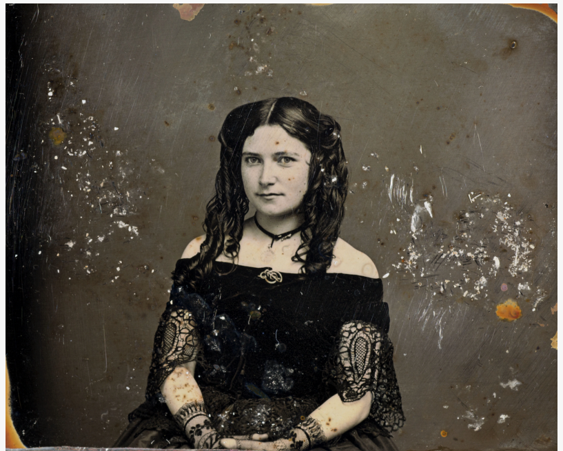
19th-century daguerreotype photograph of an unidentified young woman that the scientific mission recovery team nicknamed, "Mona Lisa of the Deep."