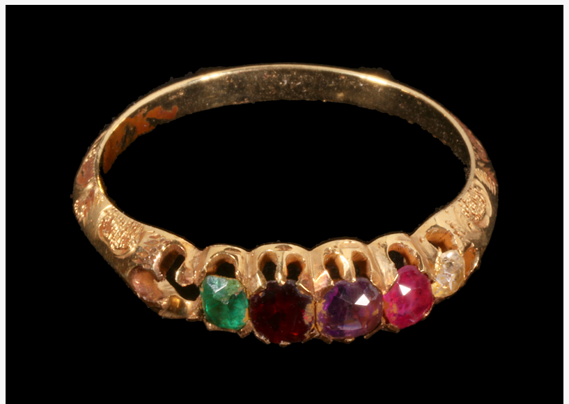
REGARD ring created with gemstones that spell out that name – Ruby (missing), Emerald, Garnet, Amethyst, Ruby, and Diamond -- recovered from the fabled "Ship of Gold," the S.S. Central America.