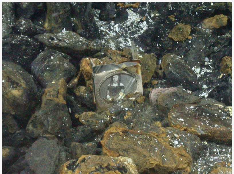
This image shows the "Mona Lisa of the Deep" daguerreotype as it was discovered in 2014 in a pile of the ship's coal on the seabed, about 7,200 feet below the Atlantic Ocean's surface.