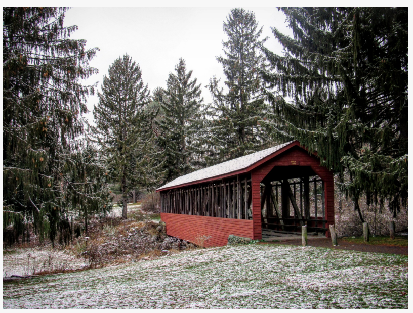
Sabrina Hilpert - People's Choice Forests - Beltzville State Park

Follow PPFF's social media channels for program announcements and <u>sign up to receive our</u> <u>weekly Take Five e-blast</u> by visiting <u>www.PaParksAndForests.org</u>.