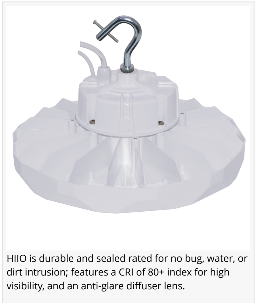
HIIO is durable and sealed rated for no bug, water, or dirt intrusion; features a CRI of 80+ index for high visibility, and an anti-glare diffuser lens.

Another example is the HIIO LED high bay light . 150-watt high bay lights are the most requested LED high bay lights. The current 150-watt LED high bay light, SYMA, is durable and sealed rated for no bug, water, or dirt intrusion. It features a CRI of 80+ index for high visibility, and an anti-glare diffuser lens. SYMA was launched in January 2022 and when it was launched was considered innovative and well-priced at $189.87. SYMA is being replaced by the 155-watt HIIO LED High Bay Light that has all the features of SYMA and more. The 155-watt HIIO LED High Bay Light is priced at $119.87, 37% lower than the older, similar LED high bay light.