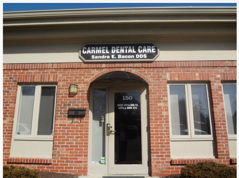
Carmel Dental Care

Carmel Dental Care is a dental clinic located in Carmel, Indiana that offers a wide range of dental services for patients of all ages. The team is highly skilled and experienced, with a focus on providing personalized care to each patient. They use the latest technology and techniques to