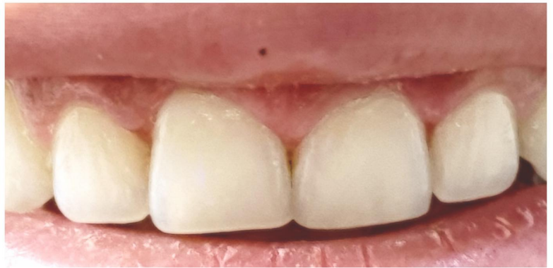
Carmel Dental Care Gingival Contouring