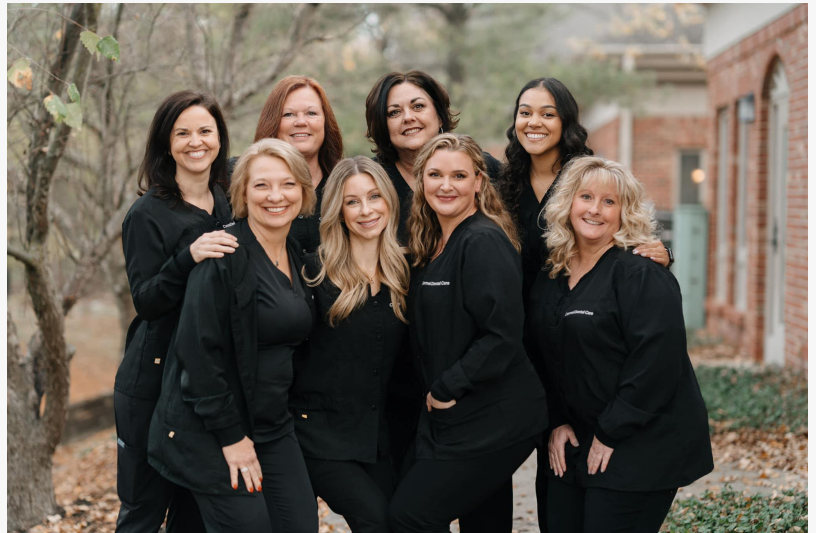
Carmel Dental Care Team

This press release can be viewed online at: https://www.einpresswire.com/article/613551588