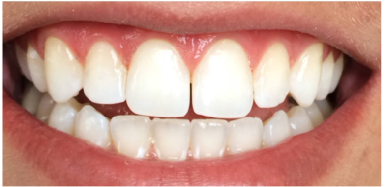
Carmel Dental Care General Dentistry