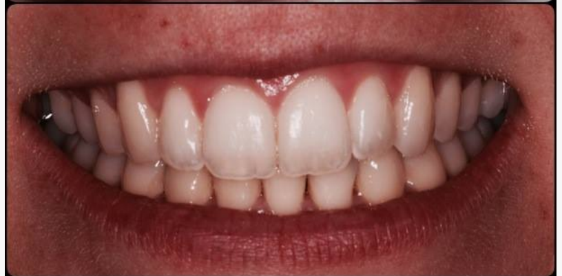
Carmel Dental Care Invisalign