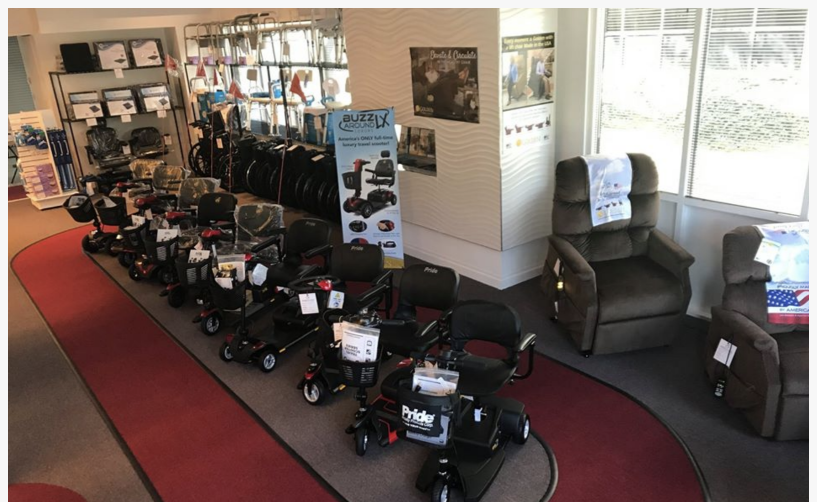
Mobility City of Fairfax County VA showroom with wheelchairs, lift chairs, and mobility scooters

Mobility City Holdings, Inc., is the premier provider of mobility equipment sales, repairs, and rentals to mobility impaired persons.