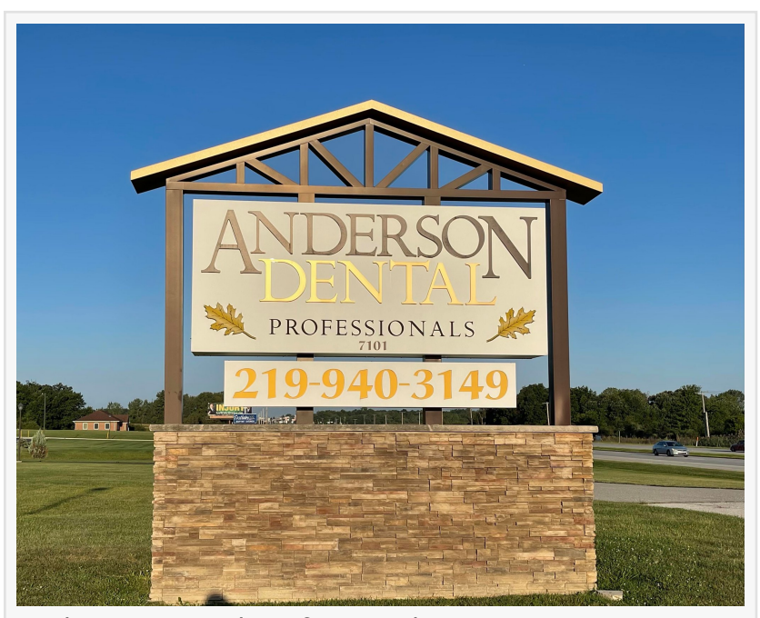
Anderson Dental Professionals Cosmetic Dentistry

"Veneers are a great option for patients who want to improve the appearance of their teeth but don't want to undergo a more invasive