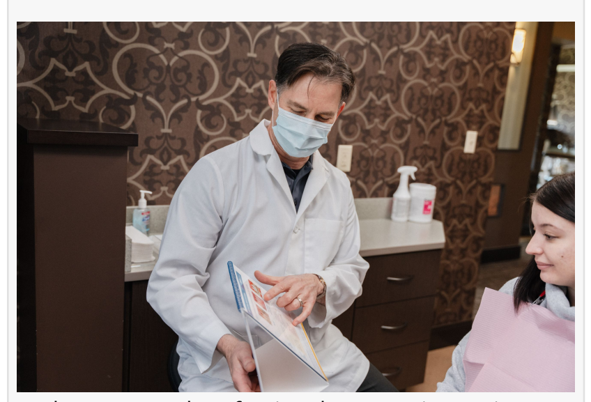
Anderson Dental Professionals Cosmetic Dentistry

available. They have invested in state-of-the-art equipment and technology to ensure that patients receive the best care possible.