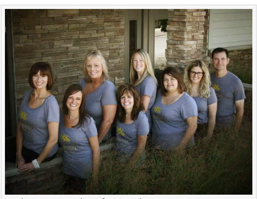
Anderson Dental Professionals Team

This press release can be viewed online at: https://www.einpresswire.com/article/613556260