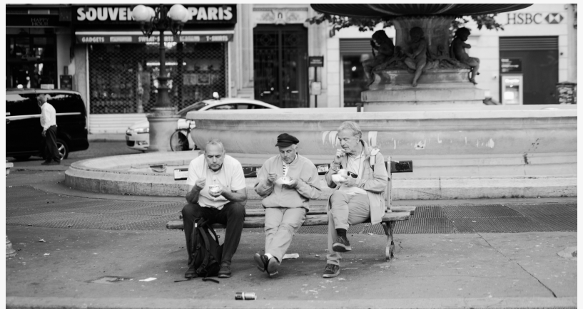
Candid Street Photography