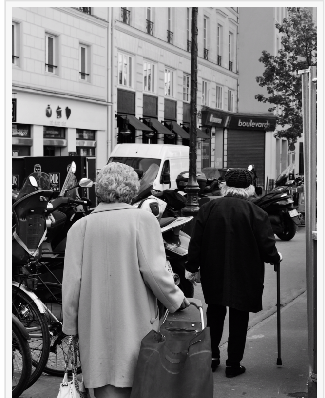
Candid Street Photography