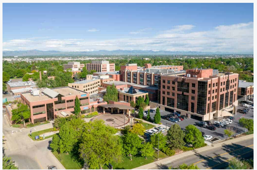
CuraWest treatment center in Denver, Colorado

DENVER, COLORADO, UNITED STATES, January 27, 2023 /EINPresswire.com/ -- CuraWest, the Denver area's premier medical detox center, has announced the official opening of its residential treatment program, which will be offered as a follow-up level of care at a newly remodeled, state-of-the-art facility in the Porter Medical Plaza. The residential wing, which will provide continuing care to clients who have completed detoxification, will open its doors on Feb. 2, 2023.