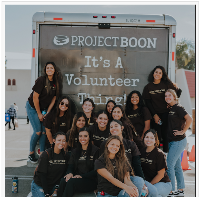
A group of volunteers is all smiles at Project Boon's Annual Eat & Be Well Thanksgiving Event

Project Boon operates events that bring together those in need, those willing to help, and the resources that make a difference. Based in Fontana, CA, the non-profit organization seeks to connect people with their local communities and encourage neighbors to support one another during times of need. Additional information can be found at https://projectboon.org .