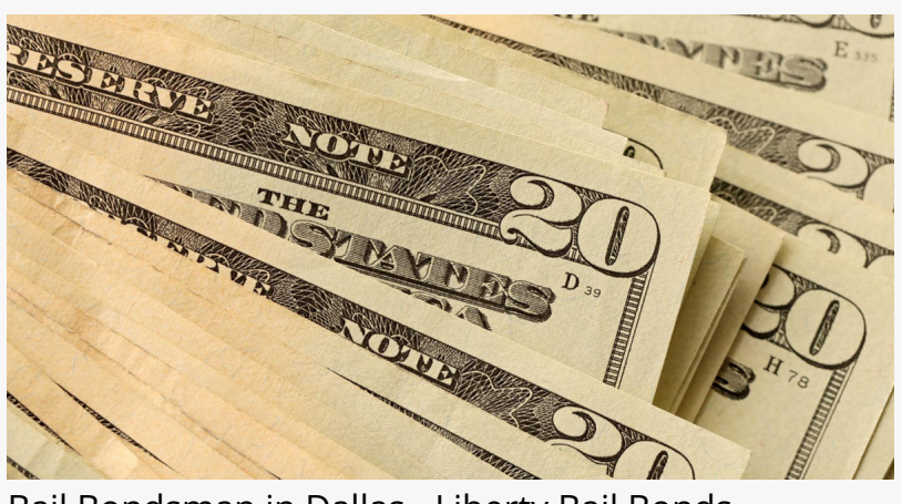
Bail Bondsman in Dallas - Liberty Bail Bonds

needed. Always seek proper legal counsel when it comes to maintaining freedom while on bail.