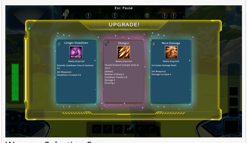
Weapon Selection Screen