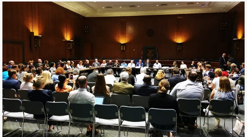
International Religious Freedom Roundtable meeting with diverse faith groups to work together to fight repression internationally