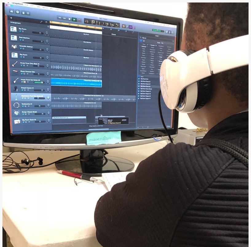
Rather than restrict a student's access to music education, The YMU Campus empowers students to access their lesson content on any device.