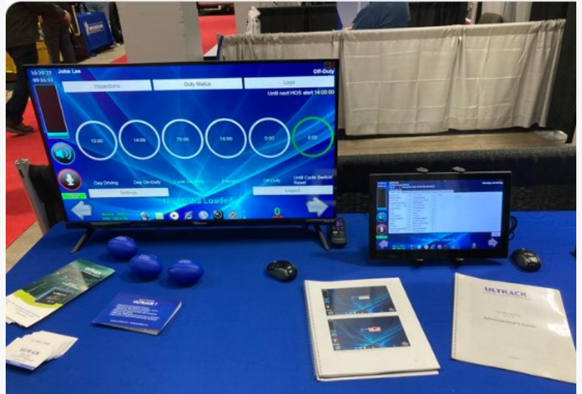
$MJLB #ELD Display

MJLB clients can monitor their driver's routes and locations at all times and streamline their paths to maximize driving time and fuel consumption. Each vehicle outfitted with a unit can be seen from the MJLB virtual map platform and managing a fleet of 10 or 1000 vehicles becomes easy, efficient, and effortless. This tool is useful in determining the quality of the driver behind the wheel and who is an asset or a liability to the company.