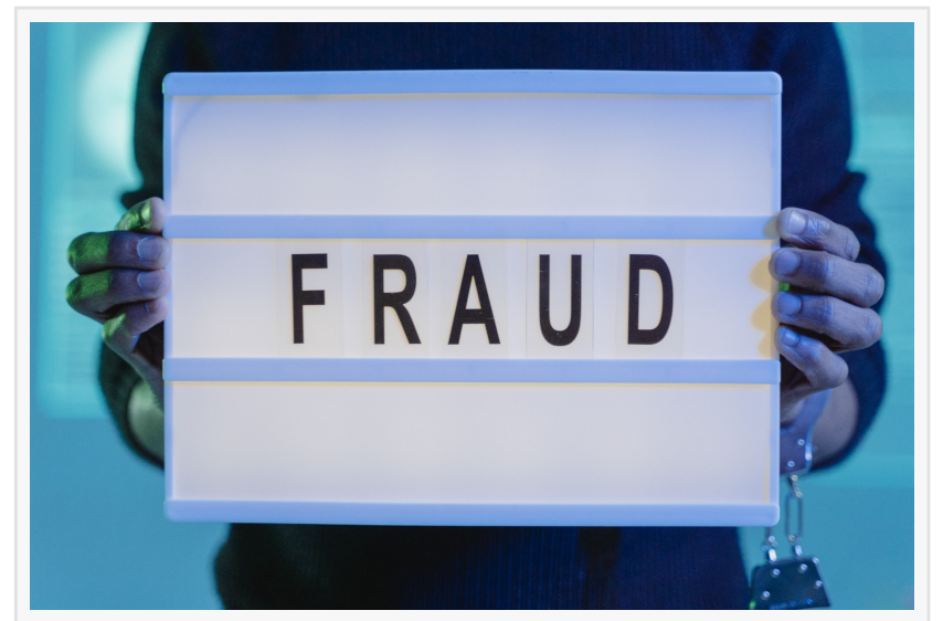
The People's Democratic Party of Jammu and Kashmir is gathering signatures to declare February 5th "Fraud Day" to highlight Pakistan's double standards.

BRUSSELS, BELGIË, February 3, 2023 /EINPresswire.com/ -- The current situation in the Pakistan Occupied part of Jammu and Kashmir, is dire. Locals are demanding freedom from Pakistani occupation and basic necessities such as food, water, and job opportunities. The area has been plagued by power outages, a lack of gas, and interference from the Pakistani army. The President of the area has embarked on a foreign trip. The local population has expressed discontent with this decision. Pakistan's actions in the region, including demographic changes and resource exploitation, have drawn criticism.