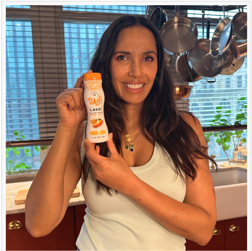
Padma Lakshmi with the new 7oz DAH! Lassi

Grab-and-go Lassi will join DAH!'s existing portfolio of Lassi in two of its signature flavors: their award-winning Alphonso Mango (with mangos sourced from India) plus their Vanilla with Cardamom, available at Sprouts retailers nationwide.