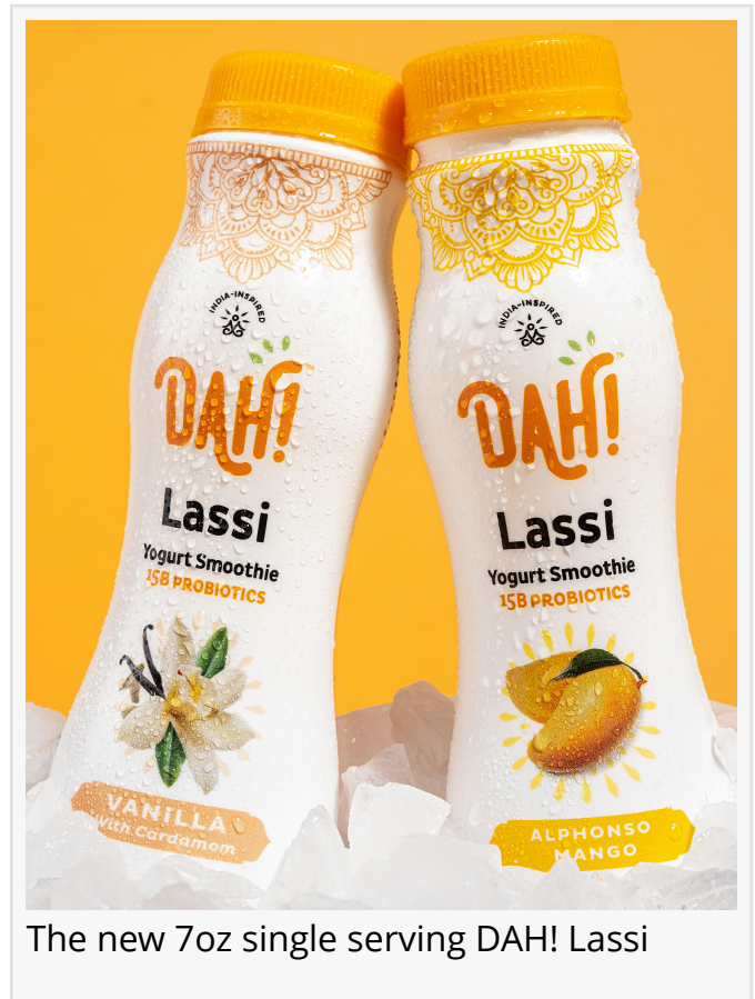
The new 7oz single serving DAH! Lassi

Padma Lakshmi officially partnered with DAH! as a board advisor at the top of 2022. DAH!'s Lassi, India-style drinkable yogurt, is low in sugar, packed with protein, contains billions of probiotics, and is absolutely DAHlicious . Rooted in the time-honored traditions of Indian food culture, DAH! yogurts are crafted through a slow-culturing process that gives DAH! its incredible flavor and smooth, velvety texture. This slower process also means their yogurts are naturally more nutritious, delivering high probiotic content and less sugar to promote digestive health and