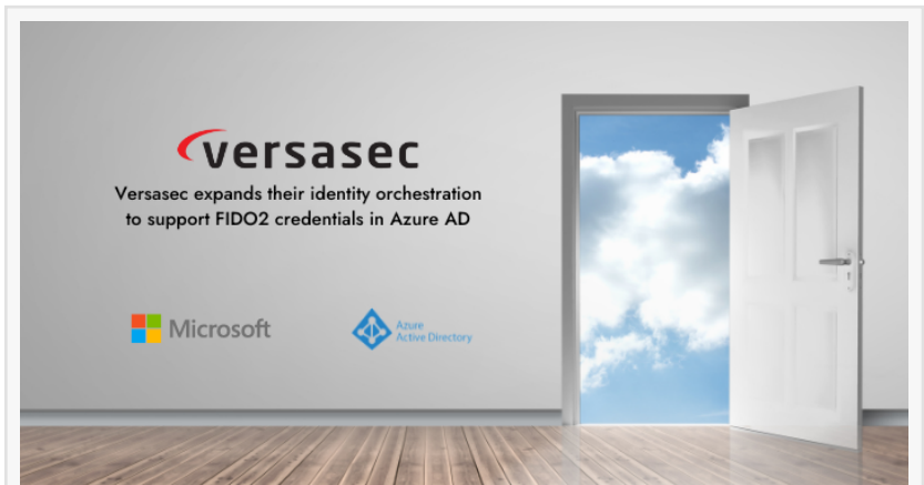
Versasec expands their identity orchestration to support FIDO2 credentials in Azure AD

“Versasec’s promise of delivering the highest level of security to businesses, regardless of size, credential type or deployment model, now extends to include FIDO in Azure AD,” stated Joakim Thorén, founder and CEO of Versasec. “By integrating TAP issuance to the