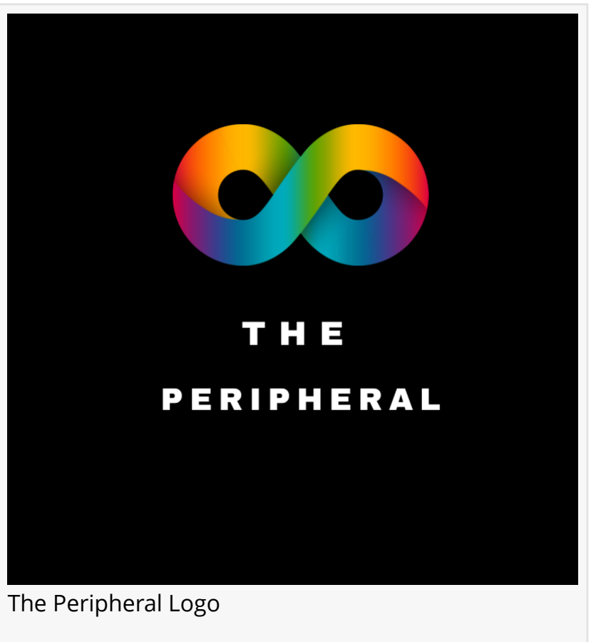
The Peripheral Logo

This press release can be viewed online at: https://www.einpresswire.com/article/614236277