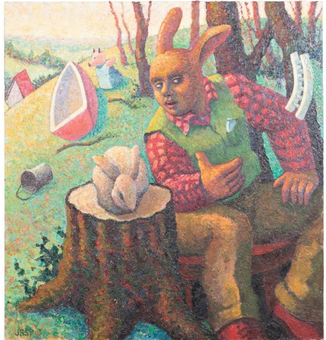
Oil on canvas painting by Robert Jessup (American, b. 1952), titled Rabbit Lecturing to a Hare, large at 64 inches by 60 ¼ inches (unframed) ($18,150).

The artist's proof bronze sculpture on a brass base by Tolla Inbar (b. 1958) was titled Sky is the Limit and depicted figures marching into the sky in a spiral formation. Impressive at 45 ½ inches