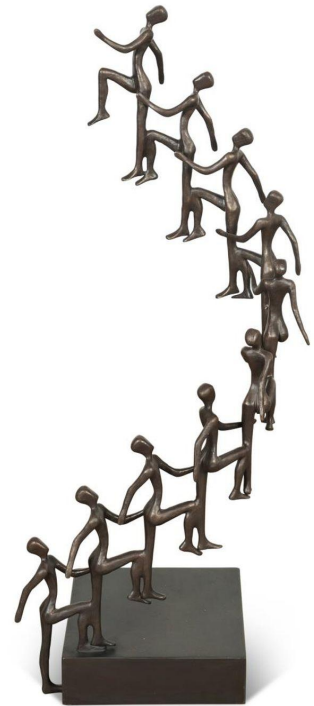
Artist proof's bronze sculpture on a brass base by Tolla Inbar (German/Israeli), titled Sky is the Limit , impressive at 45 ½ inches tall by 19 inches wide, #8 of 8 ($20,570).

Ahlers & Ogletree is a multi-faceted, family-owned business that spans the antiques, estate sale, wholesale, liquidation, auction and related industries. Ahlers & Ogletree is always seeking quality consignments for future auctions. To consign an item, an estate or a collection, you may call them at 404-869-2478; or, you can send them an e-mail, at info@aandoauctions.com .