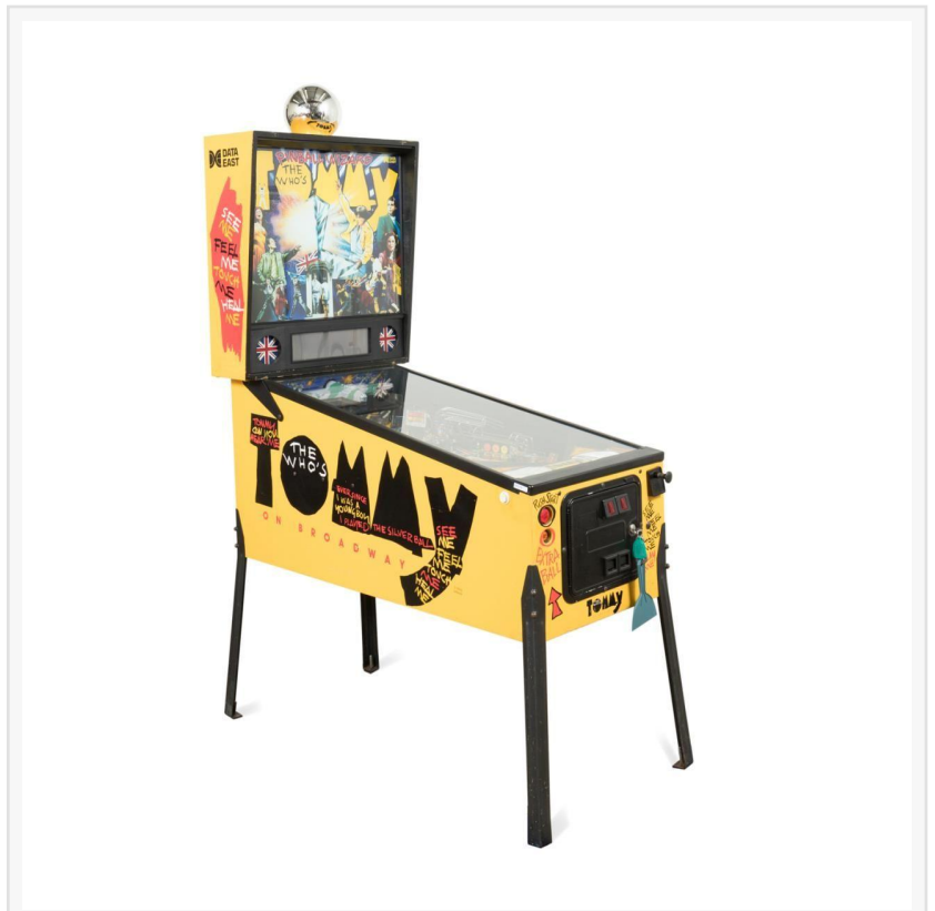
Pinball machine from The Who's Tommy on Broadway by Data East (1994), having a painted wooden case, backbox with dot matrix display and solid-state electronic components ($4,538).

This press release can be viewed online at: https://www.einpresswire.com/article/614405772