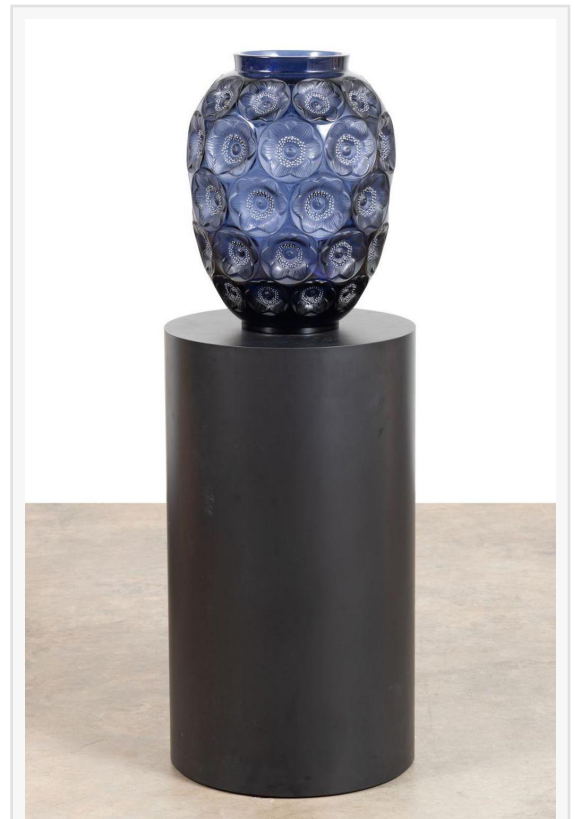
Limited edition Lalique 'Anemones Grand' ovoid form vase and pedestal, the vase 19 inches tall and executed in midnight blue crystal with white enamel accents ($24,200).

An oil on canvas painting by James McLaughlin Way (Ga., 1968-2014), titled Lion with Collar, a profile portrait of a lion with an Elizabethan ruff, hit $12,100. The 51 ½ inch by 42 inch canvas (less frame) was signed lower left with an artist's stamp, signature and a gallery label on verso.