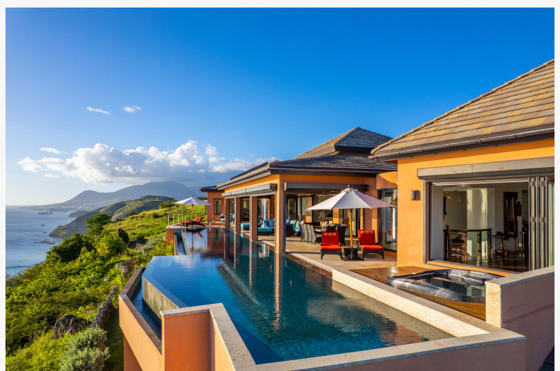
Unobstructed ocean views from the expansive terrace

Sea For Miles villa spans 16,000 square feet and sits on 1.25 acres of land. The estate offers five bedrooms, five full bathrooms, a gym/spa, staff quarters, and a three-car garage. Discover unobstructed views from the sprawling terrace that opens almost entirely to