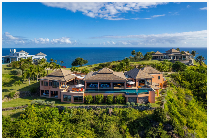
Exclusive gated enclave of only ten residences

Bidding is scheduled to open 10 March and gavel 16 March live at Sotheby's New York. Bidding will also be available on Sotheby's Concierge Auctions' online marketplace, casothebys.com , allowing buyers to bid digitally from anywhere in the world.