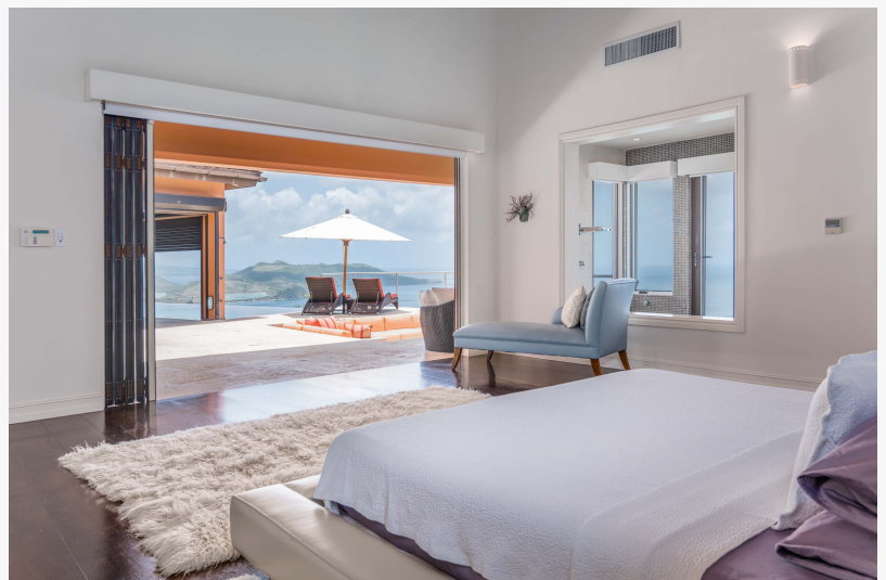
The interior opens almost entirely to the outdoors