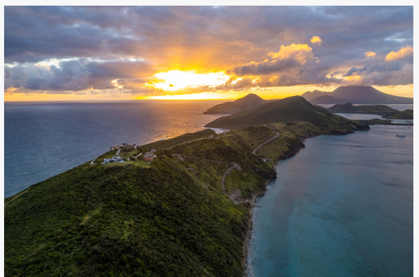
Sprawling estate 500 feet above Saint Kitts

As part of Sotheby's Concierge Auctions' Key for Key® giving program in partnership with Giveback Homes, the closing will result in a new home built for a family in need.