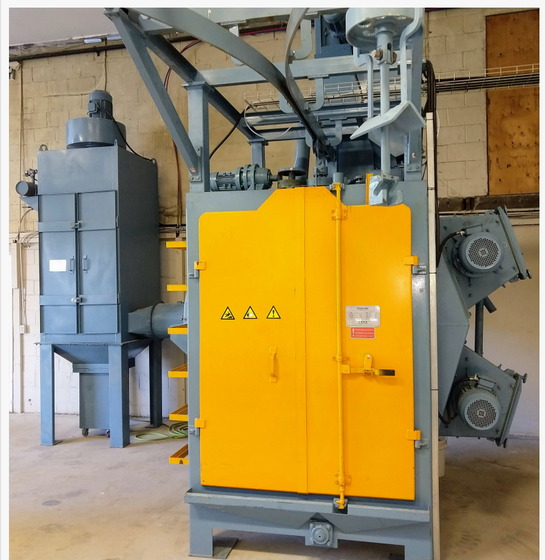
Y Track Spinner Hanger Blast System