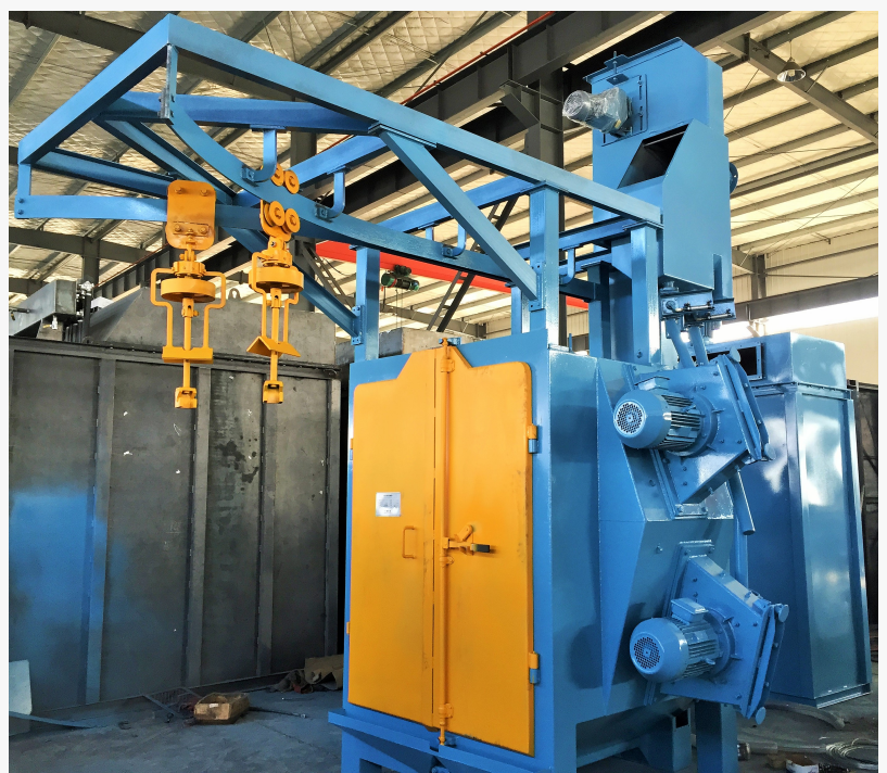
Spinner Hanger Shot / Grit Blaster

About shot blasting: This is a process for the removal of contaminants and impurities from the surfaces of metals and steel. Though the term shot blasting is all encompassing, other words are used to describe the process, such as grit blasting, abrasive blasting, peening, and media blasting. Which descriptor is used depends on the machine's manufacturer or the main use of the machine.