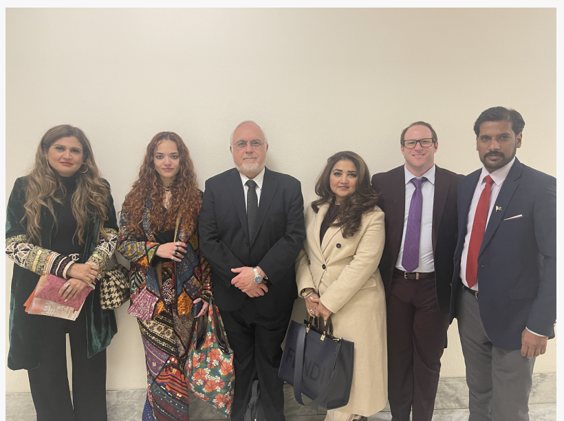
Pakistan Roundtable Delegation with USCIRF Commissioner Cooper

This press release can be viewed online at: https://www.einpresswire.com/article/614495132