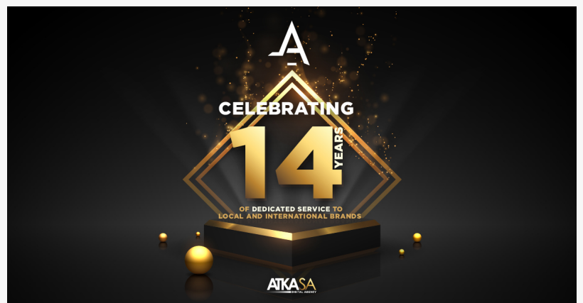
ATKASA Digital Agency Celebrates 14 Years of Dedicated Service to Local and International Brands

Since its inception in 2009, ATKASA has been dedicated to delivering innovative and effective digital marketing solutions to help brands reach their full potential. Over the past 14 years, the company has built a reputation for delivering high-quality work and exceptional customer service.