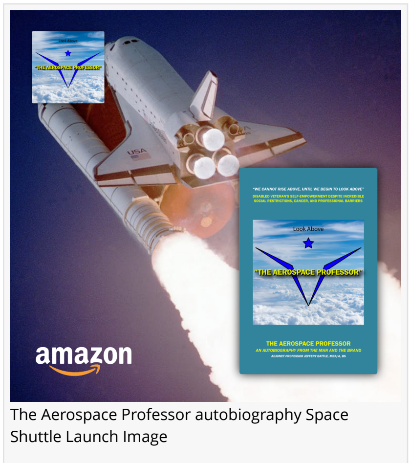
The Aerospace Professor autobiography Space Shuttle Launch Image

This press release can be viewed online at: https://www.einpresswire.com/article/614581522 EIN Presswire's priority is source transparency. We do not allow opaque clients, and our editors try to be careful about weeding out false and misleading content. As a user, if you see something we have missed, please do bring it to our attention. Your help is welcome. EIN Presswire, Everyone's Internet News Presswire™, tries to define some of the boundaries that are reasonable in today's world. Please see our Editorial Guidelines for more information. © 1995-2023 Newsmatics Inc. All Right Reserved.