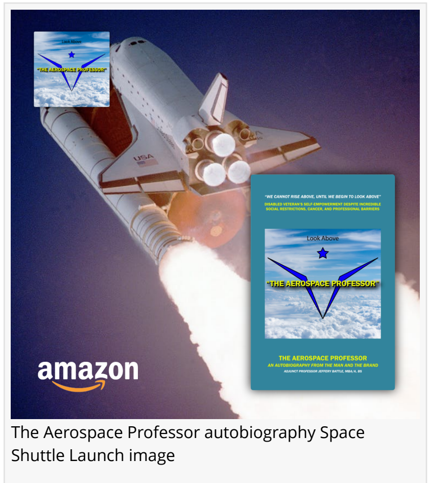
The Aerospace Professor autobiography Space Shuttle Launch image

This press release can be viewed online at: https://www.einpresswire.com/article/614585841