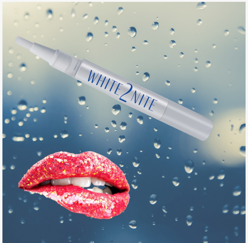
WHITE2NITE, Natural Teeth Whitening Pen