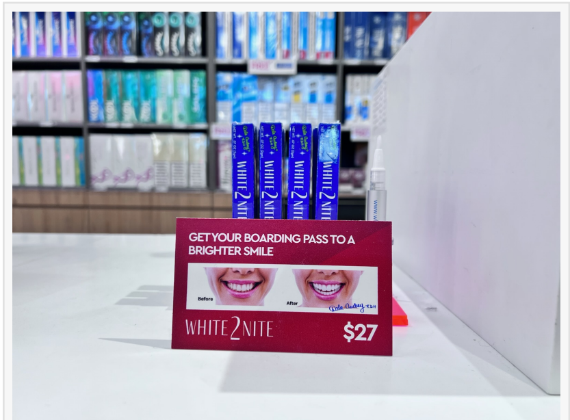
"Boarding Pass To A Brighter Smile"