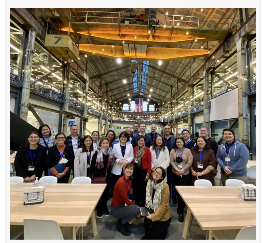
PH Delegation visited Astranis to explore space technology and internet connectivity

States and the Philippines. For more information on the Philippines-US relationship, and our