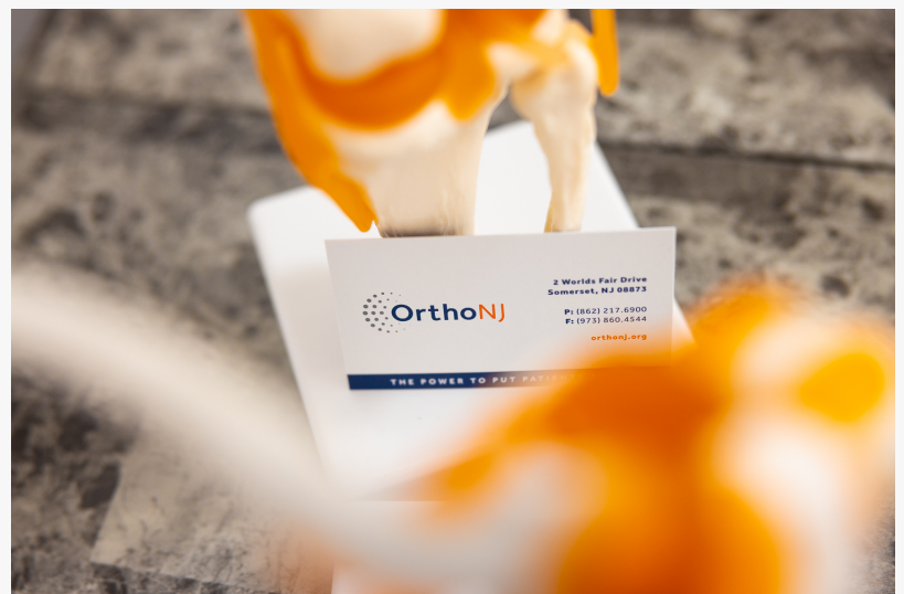
Ortho New Jersey - OrthoNJ New Jersey Orthopedics 3