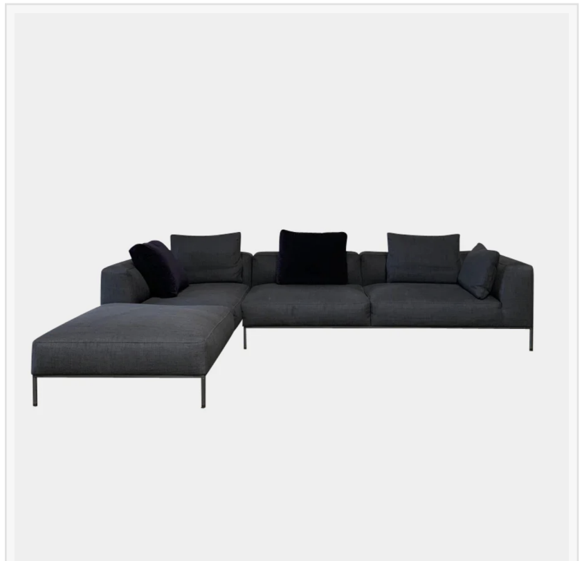
Modern Resale B&B Italia