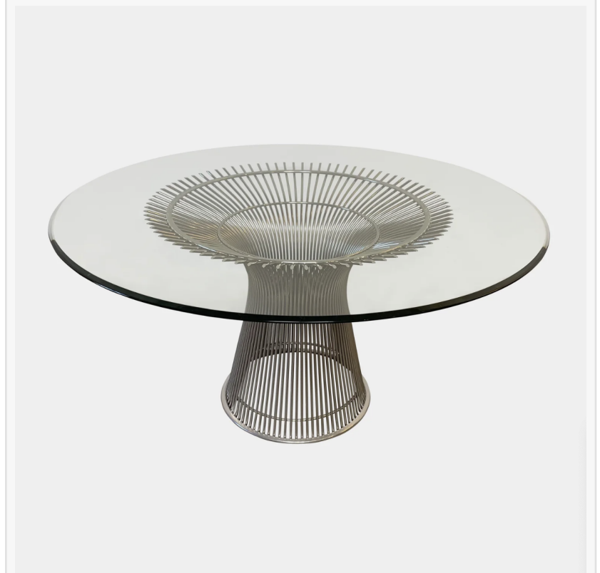
Modern Resale Platner Dining Table