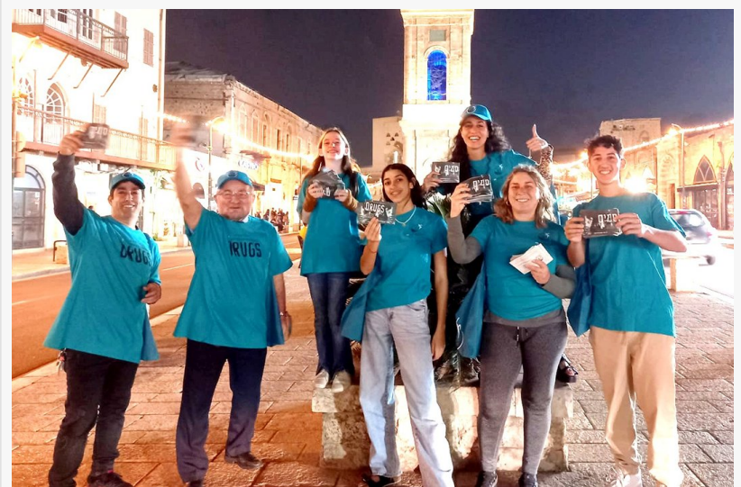
Israeli Scientologists take action to reduce drug abuse and addiction with the Truth About Drugs campaign of Foundation for a Drug-Free World.

With the Jerusalem Post reporting that the use of drugs among youth tripled during the pandemic, the past year found volunteers distributing drug prevention booklets throughout Tel Aviv and beyond. And the Center held a community open house and drug prevention symposium in April for International Youth Day to share the youth-friendly materials and educator's guides published by Foundation for a Drug-Free World, the drug-prevention nonprofit the Scientology Center supports.