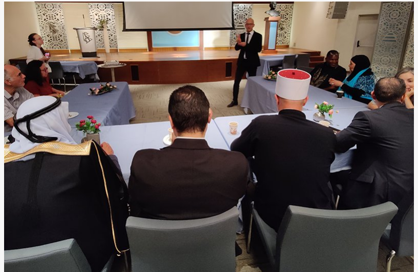
Human Rights Day forum at the Center of Scientology in Tel Aviv promotes peace through interfaith understanding and cooperation.