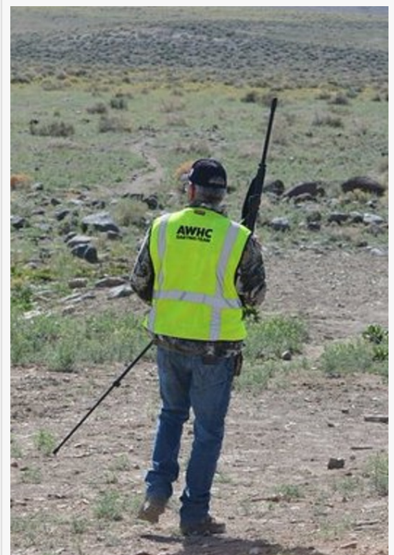
American Wild Horse Campaign volunteer stalking and shooting Wild Horses with High-Powered Gas Operated Rifle.

"Military veterans and individuals with Post-traumatic Stress Disorder (PTSD) are at increased