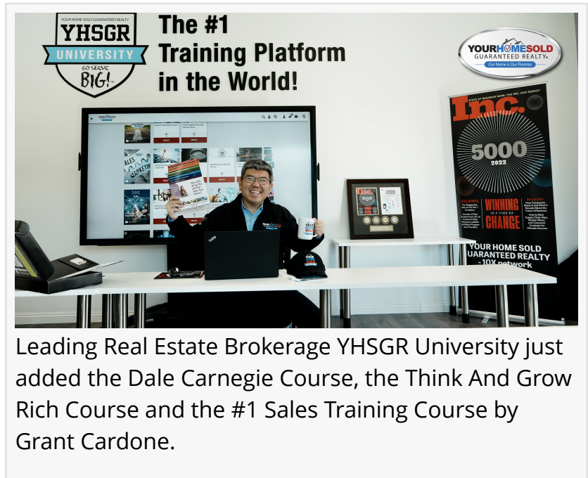
Leading Real Estate Brokerage YHSGR University just added the Dale Carnegie Course, the Think And Grow Rich Course and the #1 Sales Training Course by Grant Cardone.

Associates will access these exclusive tools, systems, and sales training segments round the clock via the YHSGR University, which aims to help hundreds of associates install high-income reduced effort systems and secure their wealth with millionaire agent coaching in real estate. The program also features one-on-one top 1% in the industry mentorship so they can go further faster in 2023.