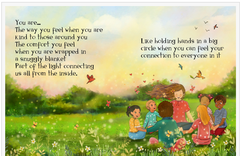
Illustration and text from You are More Than