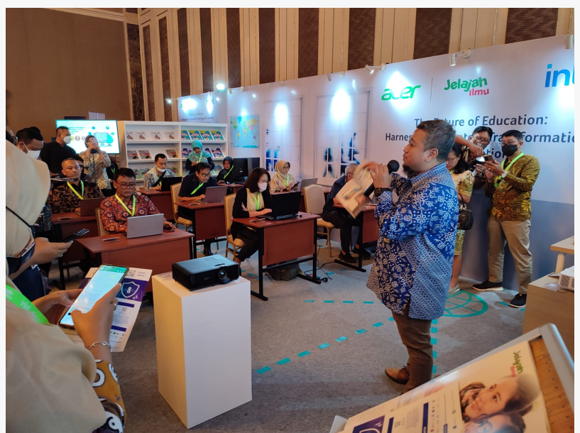
Hands-on session on the Jelajah Ilmu platform at the Acer Edu Summit 2023