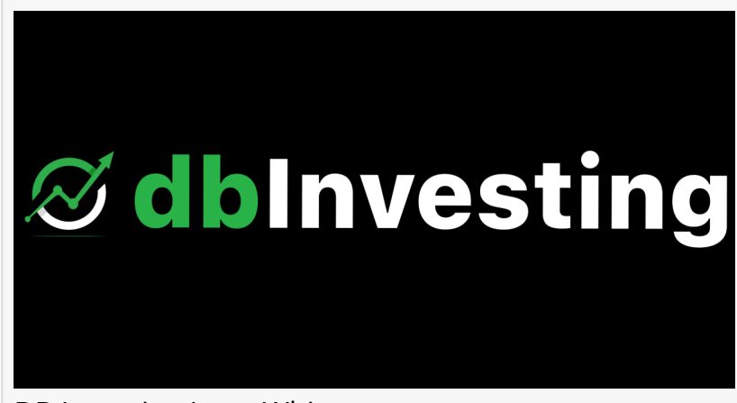
DB Investing Logo White