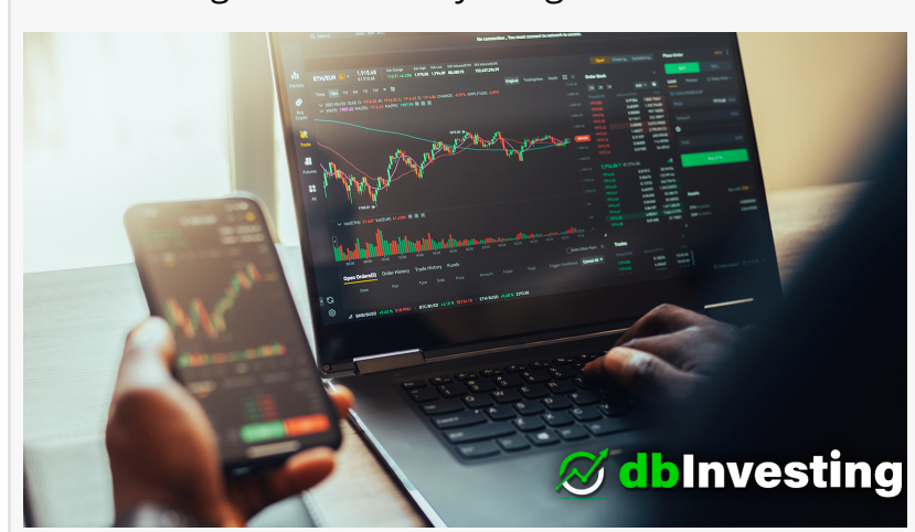
Retail FX broker DB Investing