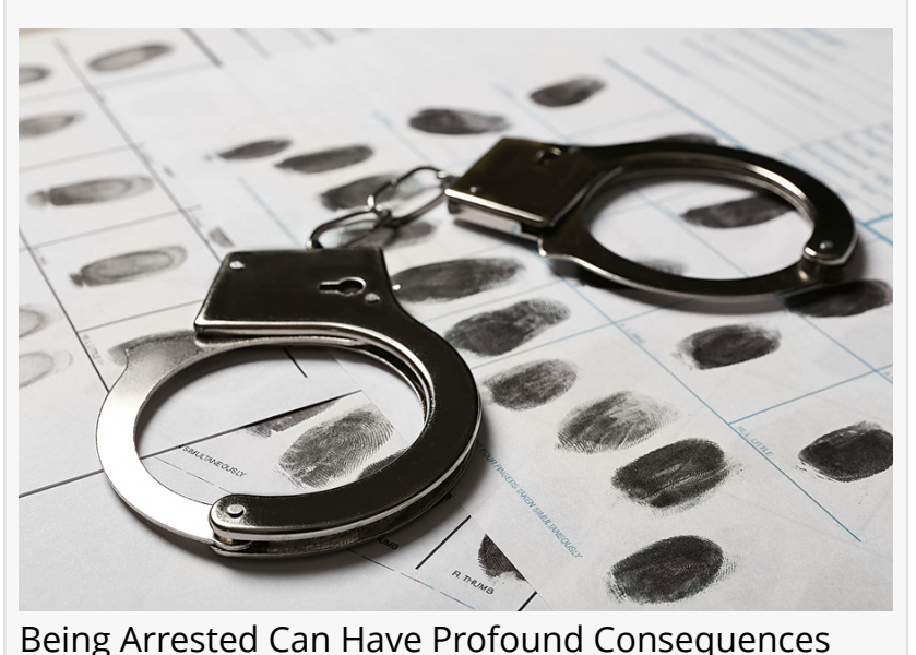
Avoid Being Arrested For a Warrant