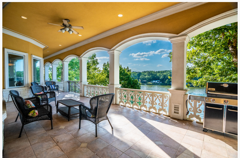
Stunning views across multiple levels of this luxury estate