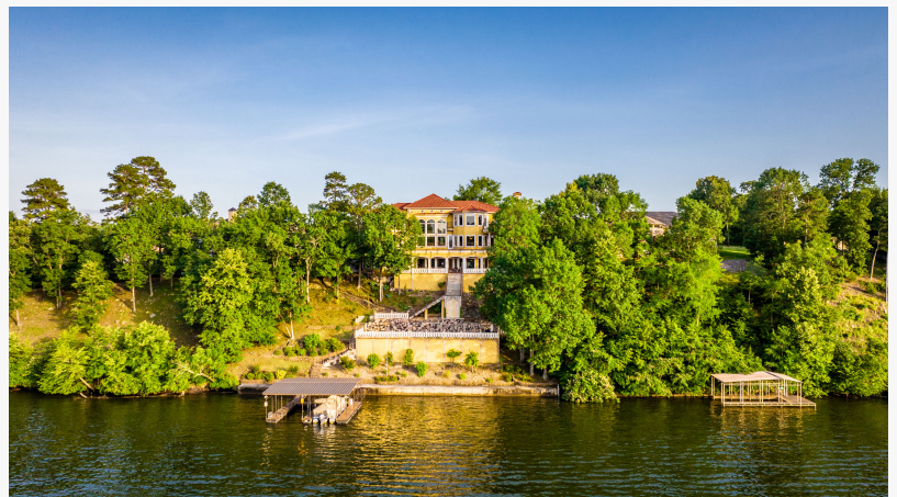
170 Cougar Terrace | HOT SPRINGS, AR