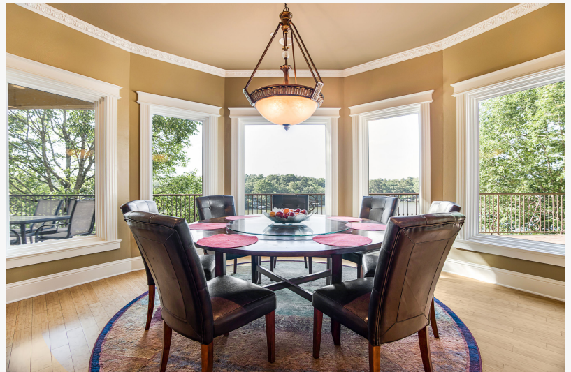
Custom Spanish/Mediterranean escape with panoramic views

Past ornate gates and a granite fountain, 170 Cougar Terrace of Hot Springs is a vision on the main channel of Lake Hamilton. Lake Hamilton becomes an extension of your backyard with a two-stall boat dock for days of fishing, swimming, and sightseeing. Amenities await indoors, including the sauna and wine cellar. Outdoors, entertain with lake-facing terraces, balconies, and a pool with a waterfront view. Stargaze from the poolside terrace before retiring to the primary suite, boasting a walk-in wall of showers and a column-flanked soaker tub.