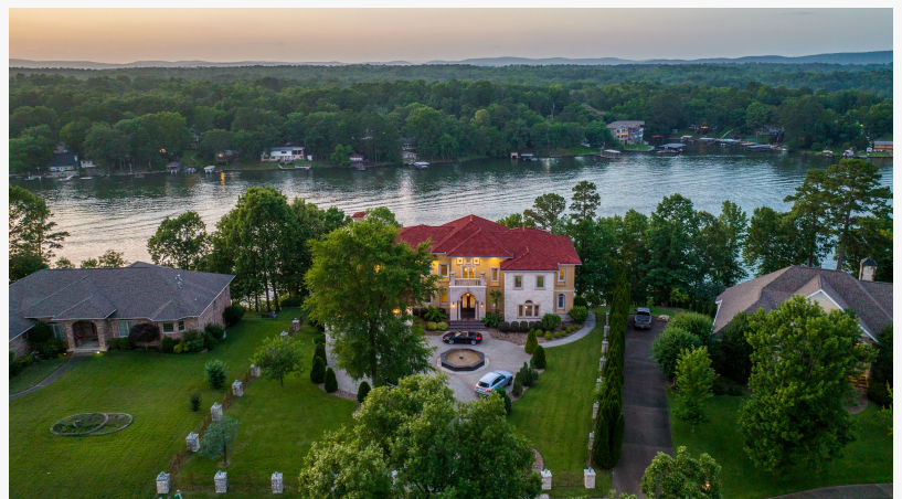
Spectacular location on the main channel of Lake Hamilton