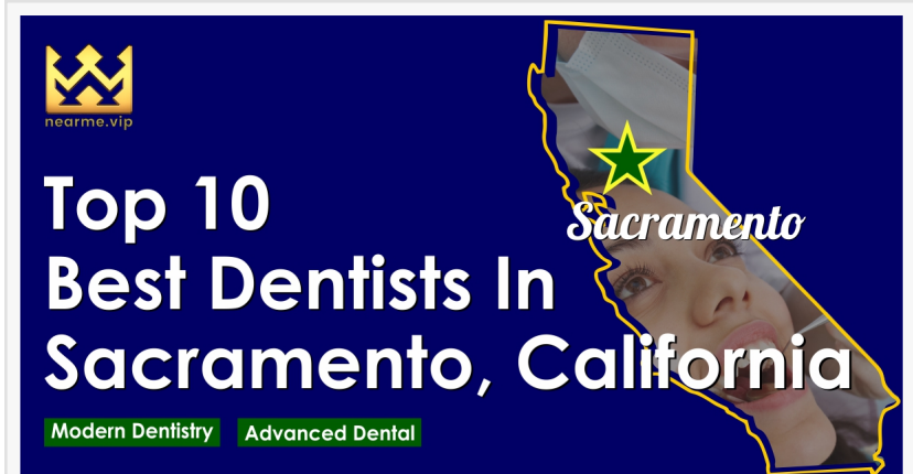
Top 10 Best Dentists Sacramento, California

Sacramento Dentistry Group is dedicated to delivering quality care conveniently and pleasantly. It provides customers with the most satisfactory possible level of dental care because its