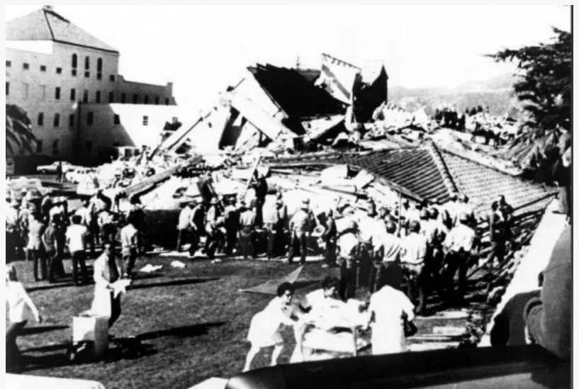
Photo from the Sylmar earthquake of 1971 taken from film's website